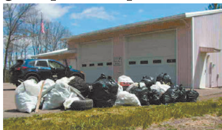
Volunteers' results from Lehigh Township's clean-up day.