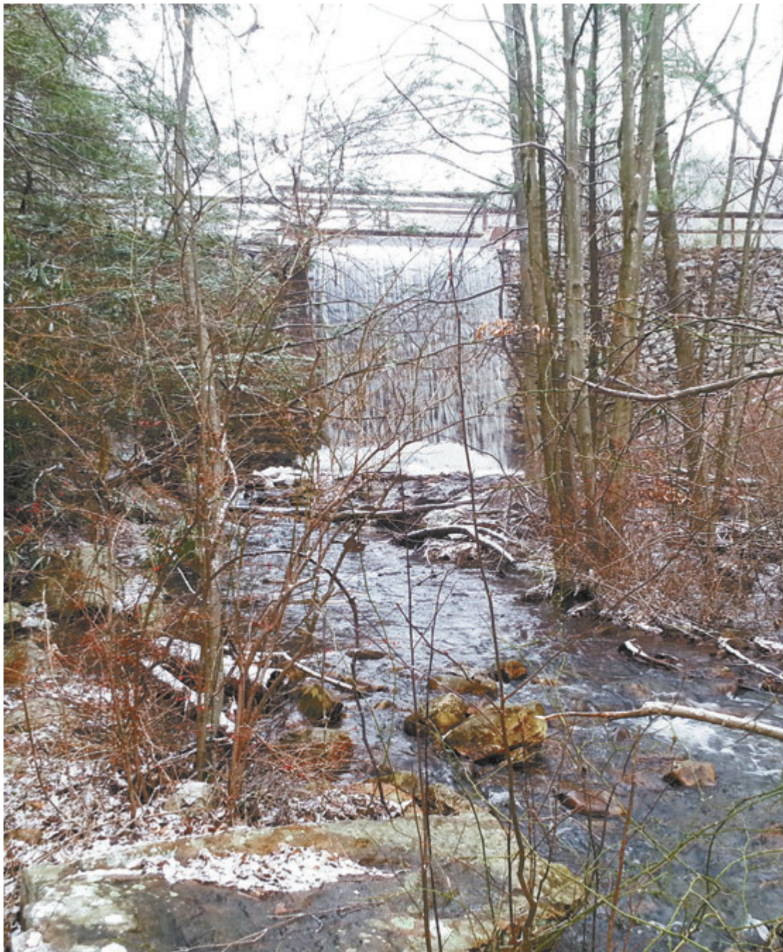
ICY BEAUTY could be found earlier this month in Hickory Run State Park. This frozen waterfall was created by the water coming off the back of the CCC dam off the upper part of the Shades of Death trail through the park.