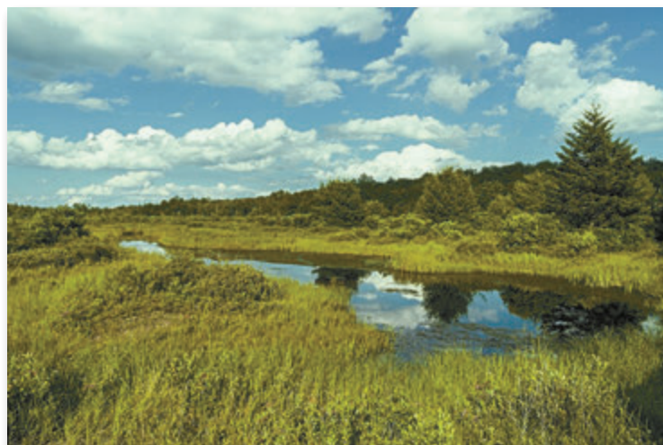
Thomas Darling Preserve in Blakeslee.