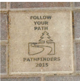
The Pathfinders' paver, representing their path to exploring life and learning.