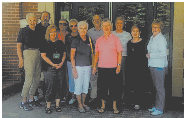
Clymer Library personnel accept the engraved paver donation from Pathfinders.

This engraved paver represents the generous donation made by the Pathfinders. The logo of a winding path symbolizes the Pathfinders' goal to explore new avenues in life and