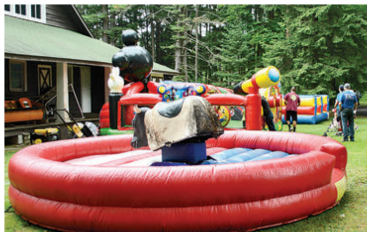
No Bull—this year's Community Day collection of kid-play options kept crowds amused.

packed Blanche Price Park for another successful celebration July 9! No bull—filled with an as-