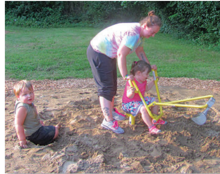
A PLACE TO PLAY: One of the new pieces of equipment at the Hemlock Street Park in White Haven is a sand scoop digger.