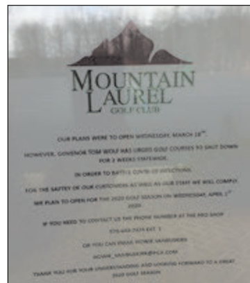
A sign on the pro shop door at Mountain Laurel Golf Club in East Side alerts golfers that the course remains closed due to the coronavirus. Mountain Laurel was scheduled to open March 18, but that was delayed when the governor closed down all non-essential businesses. The opening was postponed until April 1, but has now been postponed indefinitely.