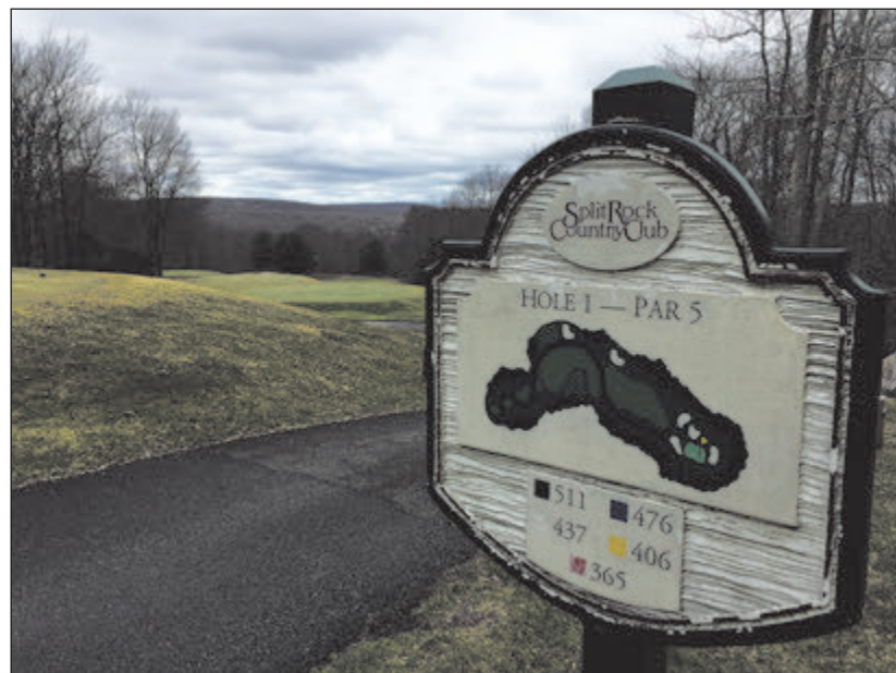
The first tee at Split Rock Country Club in Lake Harmony sits empty as golf courses statewide remain closed amid the coronavirus pandemic.

"We lost a good amount of play. We lost five tournaments