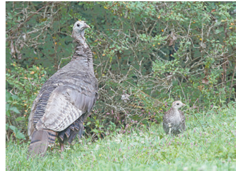
Wild turkey with poults.

in Dallas, (570) 675-1143. No reservations required.