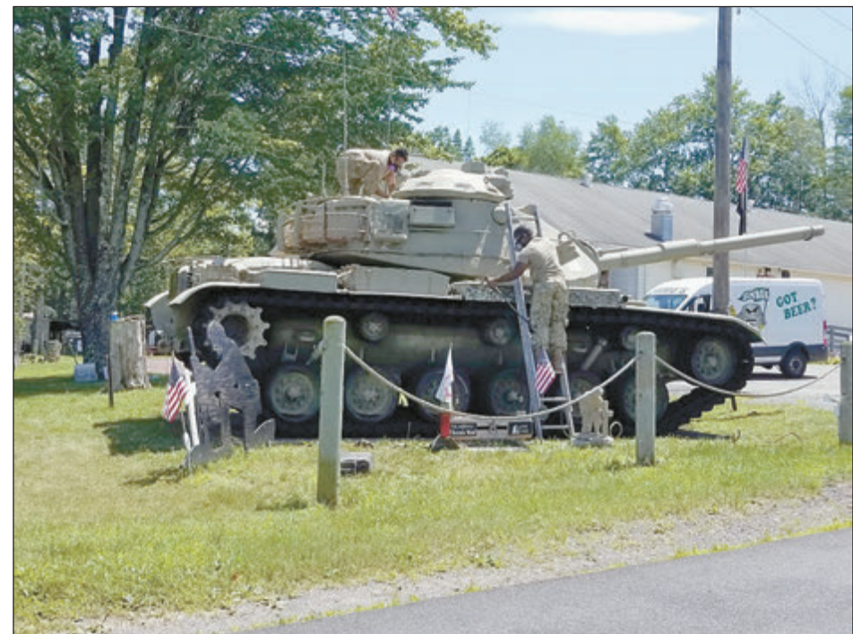
SOLDIERS FROM FORT INDIANTOWN GAP were in White Haven during the early part of this week, refurbishing the tank and helicopter monuments at VFW Post 6615 on Lehigh Gorge Drive.

Music Festival- Sunday, August 23 at 6 p.m. Faith Church, Weatherly will be holding its 2nd annual Faith Fest music night at Eurana park amphitheater. This year we will scale back our music festival due to COVID-19 precautions. We encourage social distancing by bringing your own lawn chair. Masks are encouraged and hand sanitizer will be available.