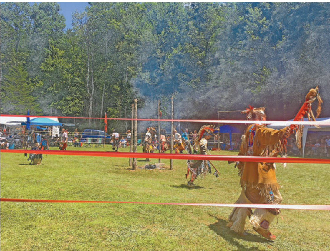
TEMPERATURES IN THE 90s on Saturday didn't deter the dancers at the Inter-Tribal Native American Pow-Wow held in Drums. Participants and vendors came from all over the eastern United States and also from Canada. Attendees stood behind the ribbon fence, socially distanced.